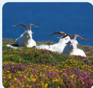
Geifr y Gogarth. Great Orme goats.

Rising like a dragon's head from the sea, it has attracted countless generations of people, from Bronze Age miners prospecting for rich mineral seams to enthusiastic Victorian families drawn to the combination of beautiful surroundings and the Great Orme's wealth of historical interest.