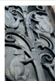
SQUIRRELS AND PEACOCKS WINDOW