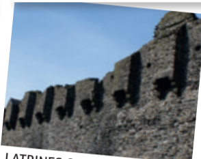
LATRINES ON TOWN WALLS