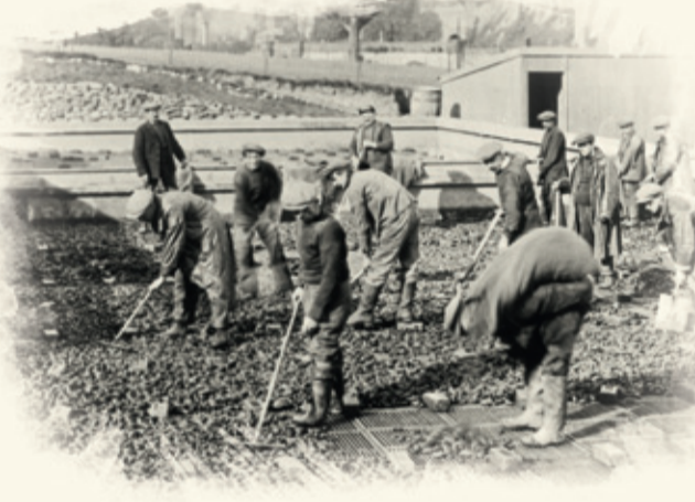
MUSSEL PURIFICATION PROCESS ON CONWY ESTUARY CIRCA 1924