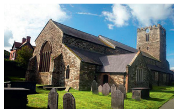
ST MARY'S & ALL SAINTS CHURCH (SITE OF ABERCONWY ABBEY)

Conwy Castle was built by King Edward I after he defeated the Welsh Prince Llywelyn the Last in 1284. This amazing feat of engineering is superbly positioned on a rocky outcrop protected on two sides by the Conwy and Gyffin rivers, and on the inland side by a large ditch. More than 1,500 workmen from all over England were employed in its construction, which was completed in just four years. It had eight towers and originally was painted white, so would have looked stunning!