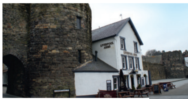
LOWER GATE (PORTH ISAF) AND LIVERPOOL ARMS