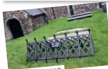
WE ARE SEVEN GRAVE