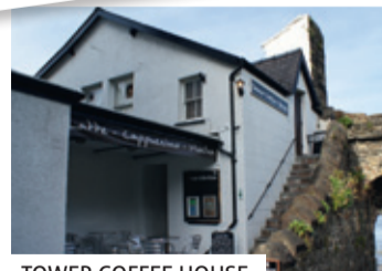
TOWER COFFEE HOUSE