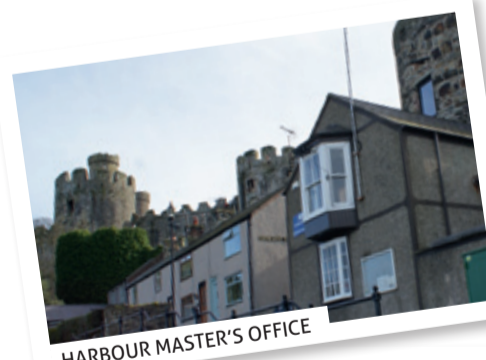
HARBOUR MASTER'S OFFICE

Turn left and cross the road at the pedestrian crossing, then turn left to see the three bridges across the River Conwy.