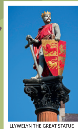
LLYWELYN THE GREAT STATUE

Leave the churchyard by the gate by the west door and turn right into Lancaster Square.