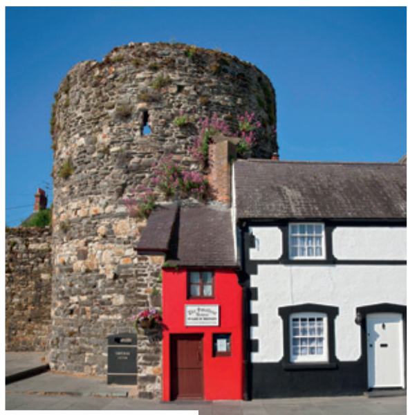
BRITAIN'S SMALLEST HOUSE