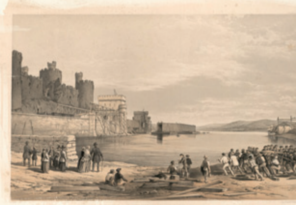
CONSTRUCTION OF RAILWAY BRIDGE - 1848

© Design and illustration by Starfish Design, Llandudno, Conwy.