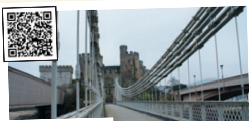
THE THREE BRIDGES