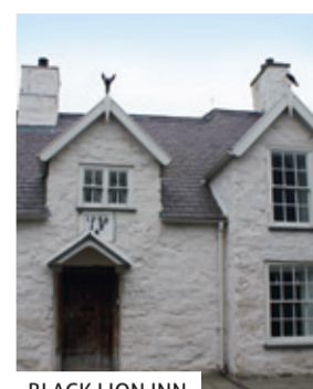
BLACK LION INN