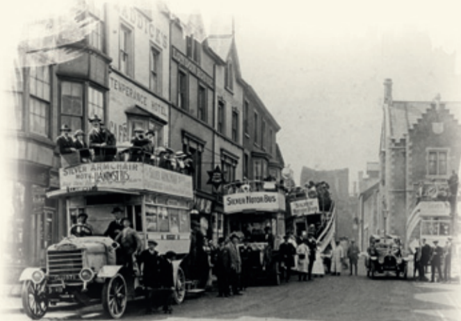
LANCASTER SQUARE CIRCA 1915

Take this 80-minute tour of Conwy to see some of the most interesting features of the walled town and UNESCO World Heritage Site.